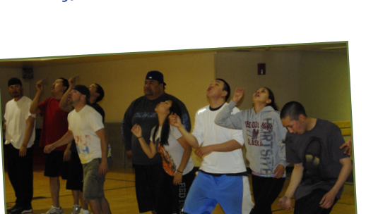
The feather race is off to a billowing start!