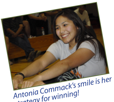
strategy for winning!