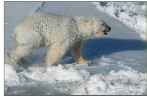
Chukchi Sea polar bear study 2010.

The US Fish and Wildlife Service (USFWS) will continue their polar bear survey again in 2011.